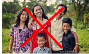
With other people